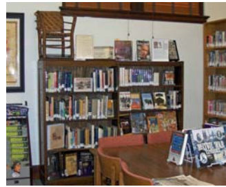
Child-size Hickory Chair on display in the Indiana section

Back Home Again in Indiana..... View this new exhibit soon!